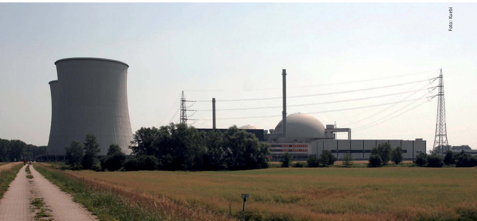
Image 2: Nuclear energy plants create large amounts of electricity from small amounts of nuclear fuel (Seen here the Nuclear Power Plant Biblis). 13,000 nuclear reactors would be required to replace the current energy consumption of fossil fuels.

Viewed globally, nuclear energy alone cannot be the solution for the climate problem as 13,000 nuclear reactors would be necessary to replace the energy provided by fossil fuels. Any nuclear reactor can, with minor modifications, be used to produce Plutonium for weapons, and every reactor can be a potential target for a horrific terror at-