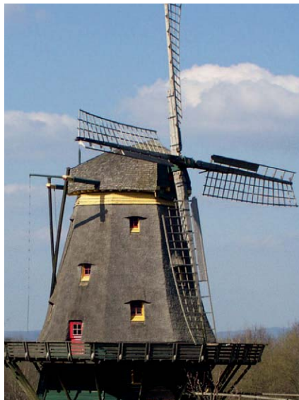
Image 3: Windmill from 1822 from Borsfleth in Schleswig-Holstein and now located in the open-air Museum Hessenpark in Neu-Anspach.