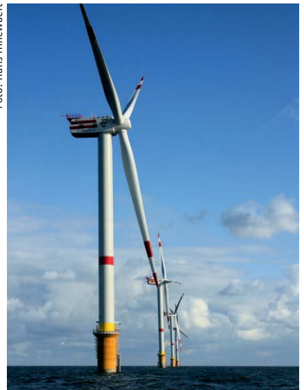
Image 4: As the winds are stronger on the open seas than on the land, it makes good sense to set up offshore wind farms despite the higher investments and maintenance costs. Each of the rotors, located off of the Belgian coast has a diameter of 126 m and a capacity of 5 MW.

a few people use it. If every German used pellet heating, then in short course all of the forests would be cut down. The combustion of biomass also releases CO 2 and can only be referred to as renewable as long as only as much is used as is replanted. It's easy to show why biomass is not a solution to the energy crisis, as huge agricultural areas are required for the production, leading to direct competition with the production of foodstuffs. The amount of corn required to produce one tank of gas is enough to feed one person for a whole year. In the face of starving people on this earth, who would dare drive a car?