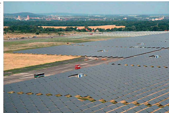
Image 6: In Waldpolenz-Solarpark near Leipzig, the world's largest thin-film photovoltaic facility is being constructed and consists of cadmium-telluride thin film cells.

ject of basic research. The goal is to develop inexpensive and efficient cells that use little energy and few resources in their production. The prospects of achieving these goals look good for the coming decades.