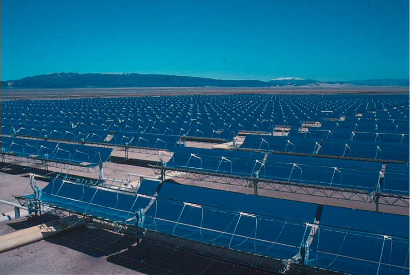
Image 1: Large solar power stations in the desert regions of the earth (seen here in California/USA) are capable of securing humanity's long-term energy requirements. A solar power parabolic trough system uses cylindrical mirrors to concentrate sunlight onto absorber tubes. The heat created is transferred to a steam plant and generates electricity.