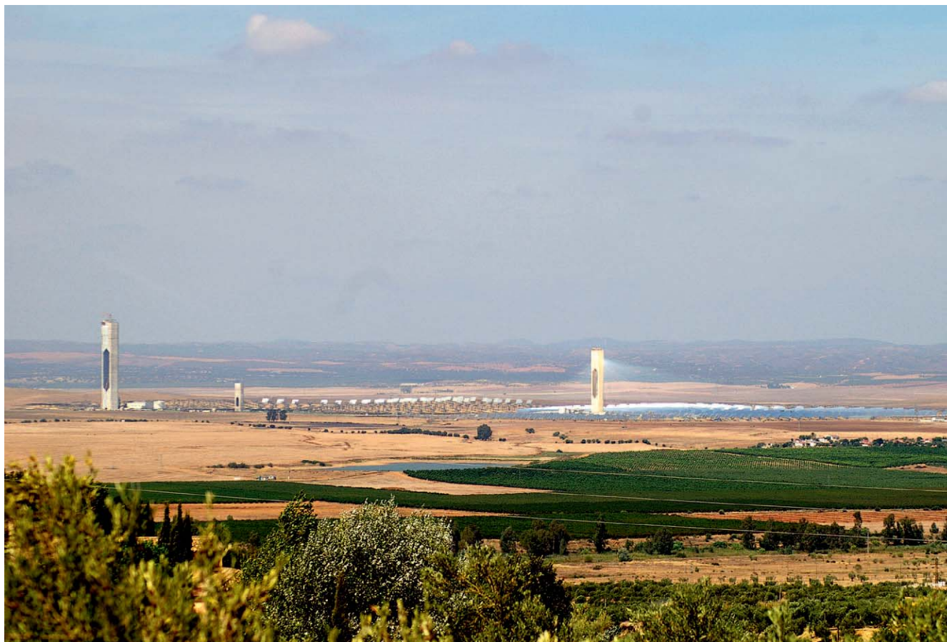
View of 3 CSP Power stations near Seville