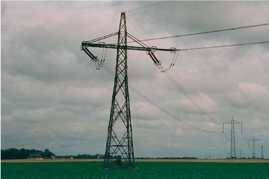
High voltage direct current (HVDC) cables in Sweden

on fossil fuels. The big advantage of this type of power station is that in addition to saving fossil fuels it has a higher energy efficiency than conventional power stations.