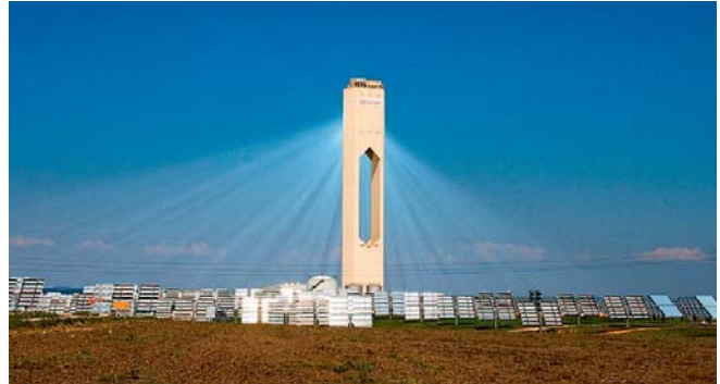
The PS10 test facility in Seville, in southern Spain with an electrical capacity of 11 megawatts, demonstrates the possibilities of solar thermal tower power.

Solar tower power stations consist of concentrating mirrors, or heliostats, that follow the position of the sun precisely. These heliostats then focus the sunlight onto the tip of a tower, where the heat is collected and injected into a heat-absorbing medium, like air or water. The ability of the solar power towers to concentrate heat is much greater than with parabolic trough designs, and temperatures between 600-1,000 °C can be achieved. This is about equal to operating temperatures in conventional power stations like coal, natural gas, and nuclear power with a steam circulation. These high temperatures even make it possible to turn water into steam at the tip of the tower and to run a turbine directly instead of having to run over a medium and to create steam in a secondary circuit. The ability to highly concentrate the light means a very efficient conversion of solar energy into heat with an efficiency of 70 percent and more. Generally, the degree of efficiency of the complete solar power tower stations is about 25-40 percent. Large power stations consist of several thousand heliostats with surfaces of several dozen square metres each and a tower of 100-200 m in height could principally generate many hundred megawatts of electrical energy from sunlight.