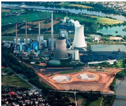
Großkrotzenburg – a coal power station

Aside from the political and economic boundary conditions in North African States, that will play a key role in the realization of the project, there is also no clear go-ahead for clean electricity from Africa in the European Union. Instead, in the past the member states of the European Union have always had a hard time creating an effective and broadly positioned energy policy.